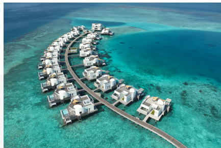
Direct access to the Sea