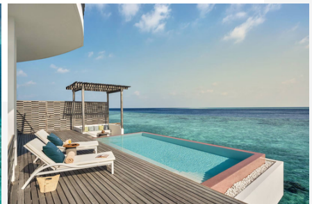
Private 7-metre Infinity Pool

Immerse yourself in the unparalleled beauty of the Maldives with our contemporary Ocean Villa with Pool. Bathed in natural light from sleek skylights and floor-to-ceiling windows, this serene retreat offers the perfect escape. Enjoy the privacy and tranquility as you take in breathtaking ocean views, letting the endless blue soothe your mind and rejuvenate your spirit.