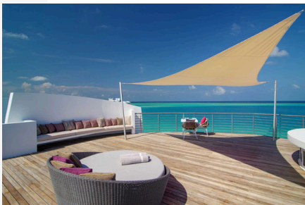
Private Rooftop Terrace

Sink into serenity whilst floating above crystal waves.