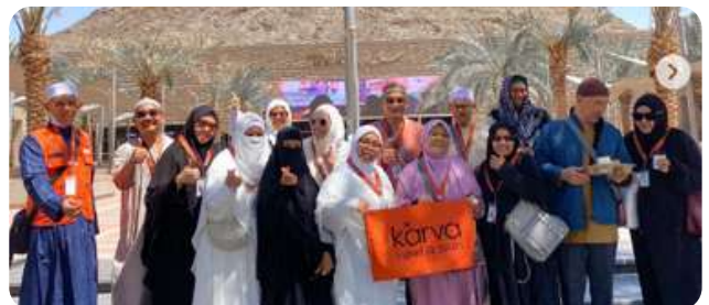
Wahyu Museum / Gua Hira Hike