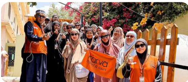
Taif City with Lunch