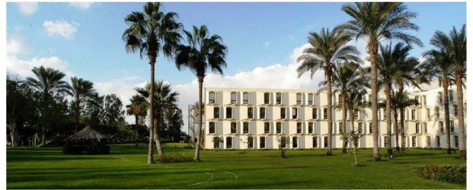
Le Passage Cairo Airport Hotel ★★★★★ Cairo, Egypt | 3 Nights