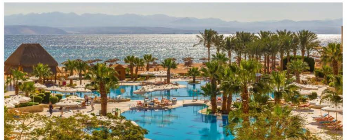
Strand Beach Resort Taba Heights ★★★★★ Taba, Egypt | 1 Night