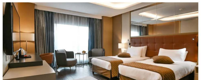
Petra Moon Hotel ★★★★★ Petra, Jordan | 1 Night