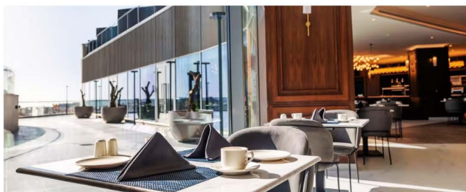
Radisson Blu Hotel ★★★★★ Amman, Jordan | 1 Night