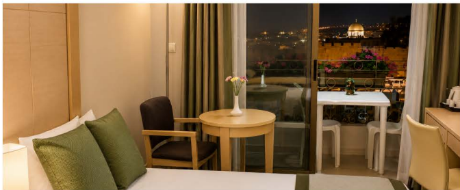
Holy Land Hotel ★★★ Jerusalem | 3 Nights