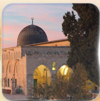
📍 AL-AQSA MOSQUE