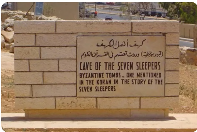
The Cave of Ashabul Kahfi

Transit in Doha before arriving back in Singapore, bringing home unforgettable memories from your spiritual and historical journey through Jordan and Baitulmaqdis.