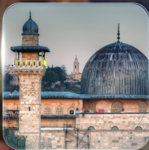
📍 MASJID AL-AQSA