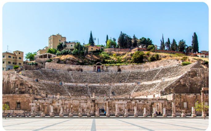
Amman Citadel & Roman Theatre