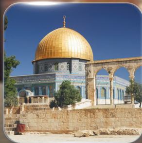
📍 DOME OF THE ROCK