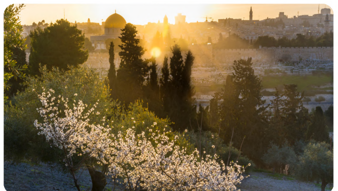
Mount of Olives