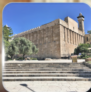
📍 IBRAHIMI MOSQUE