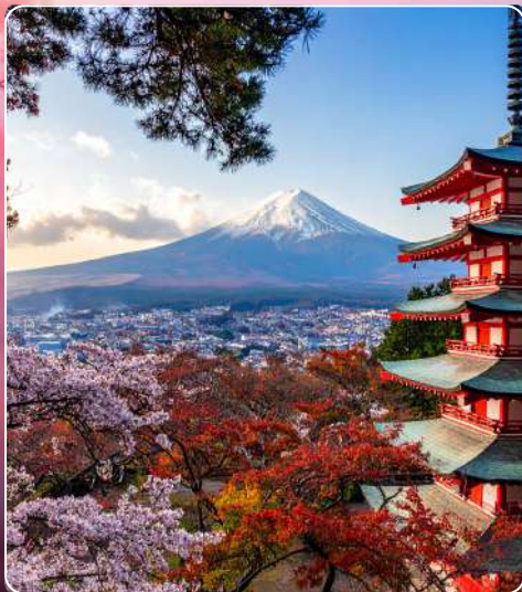
MOUNT FUJI TOUR