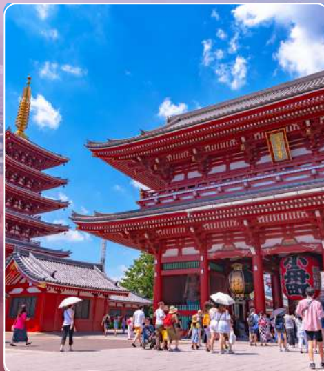
ASAKUSA & NAKAMISE